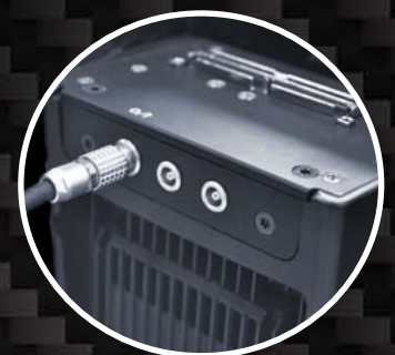
IPEX PAUT connector, 2 pulser-receivers and Encoders (I/Os)