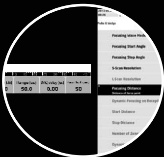
Easiest GUI, quick access buttons and expert menu